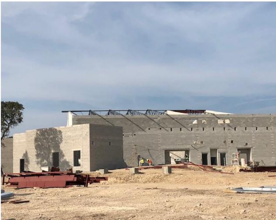
View Looking West at Kitchen, Cafeteria and Gym