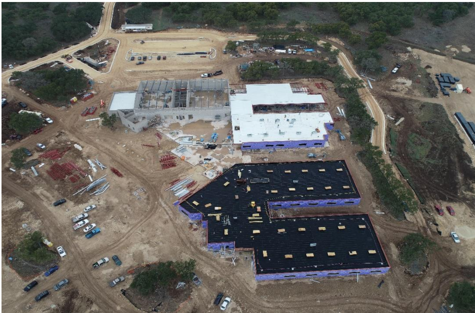
Aerial View