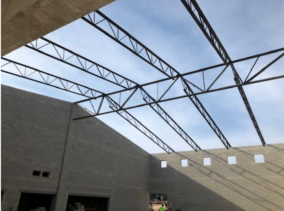
Roof Framing at Cafeteria