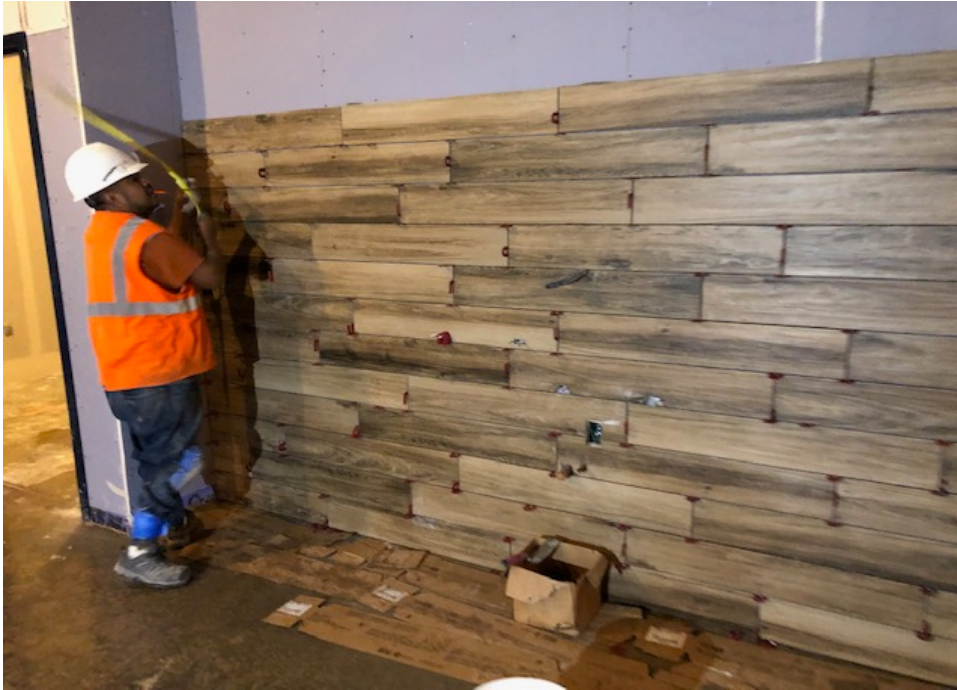
Wall Finishes Outside of Restrooms at 2 nd Grade Wing