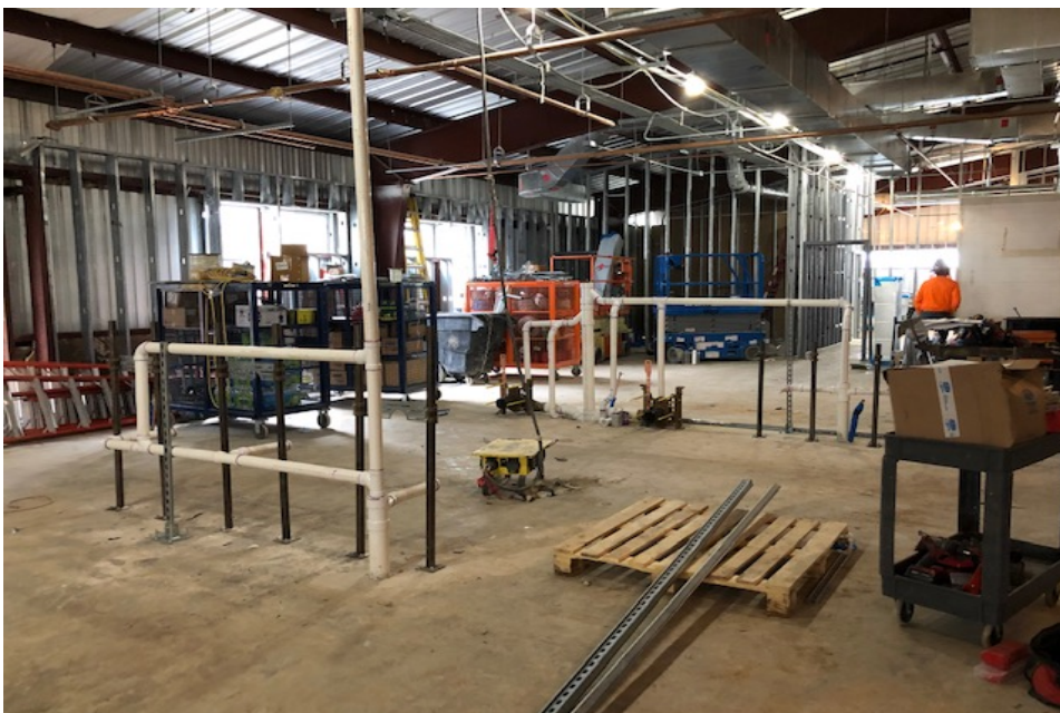
Plumbing Rough-in and Wall Framing at Athletics Area.