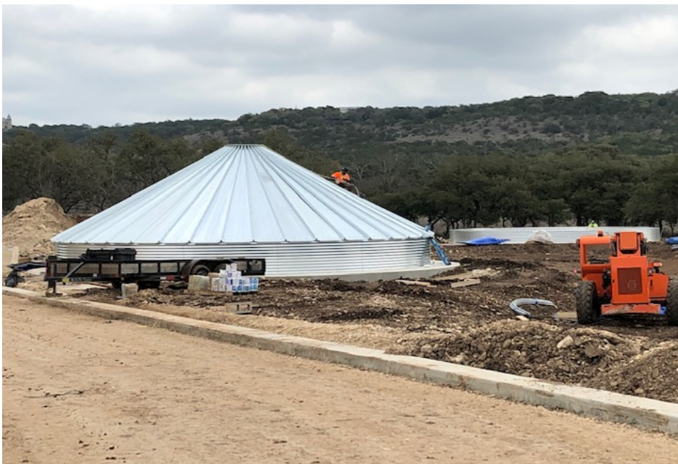
Fire Water and Rain Water Storage Tank Installation